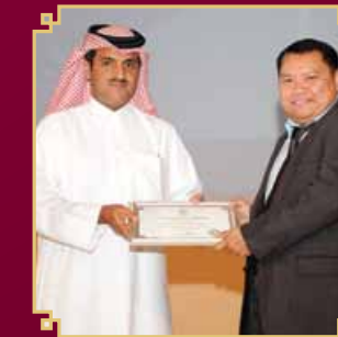
Demvic Canabano Expansion & Start Up