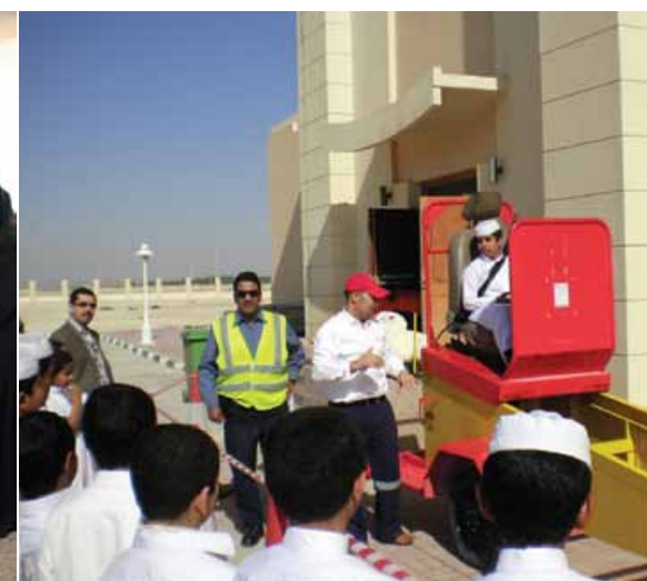
RLC Road Safety Campaign