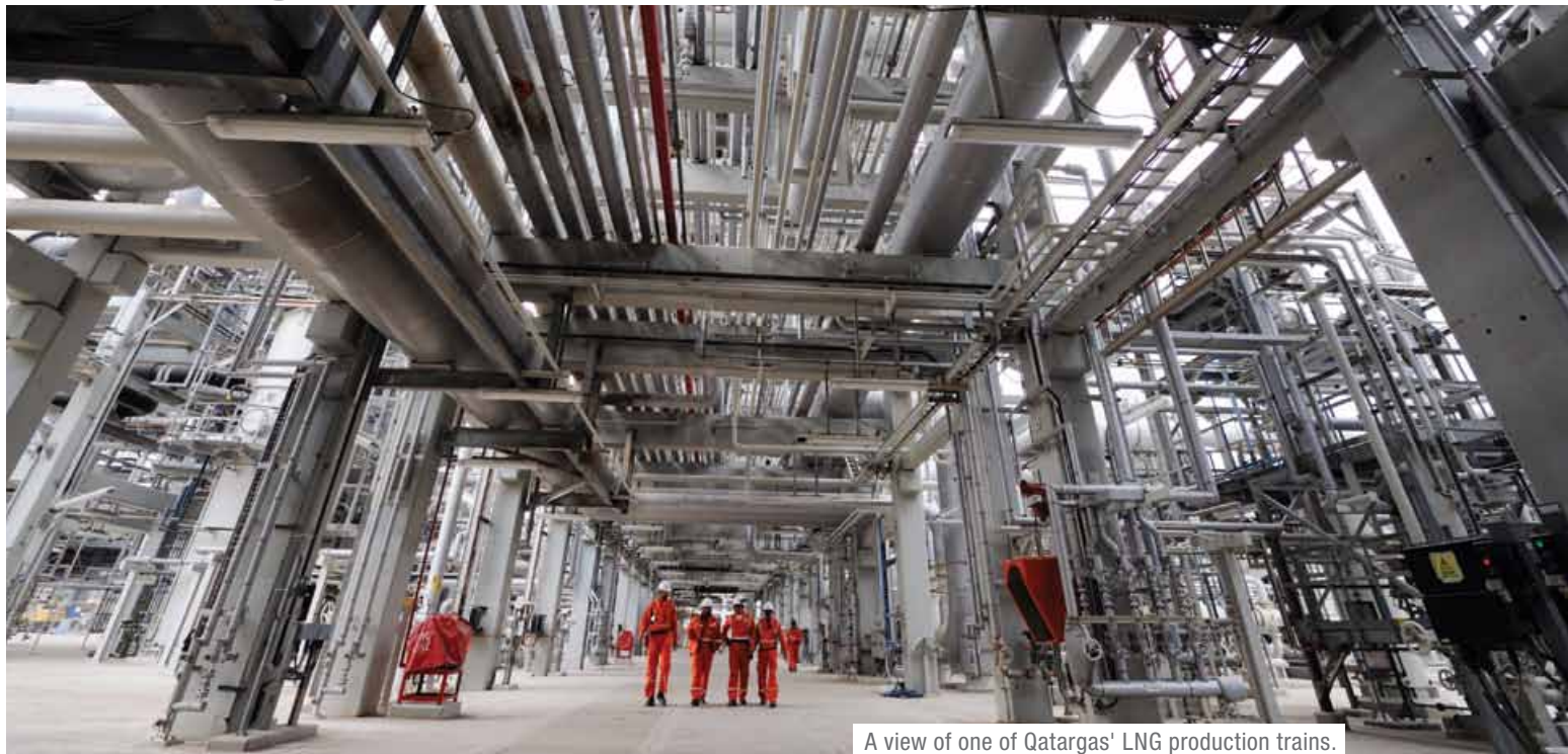
A view of one of Qatargas' LNG production trains.