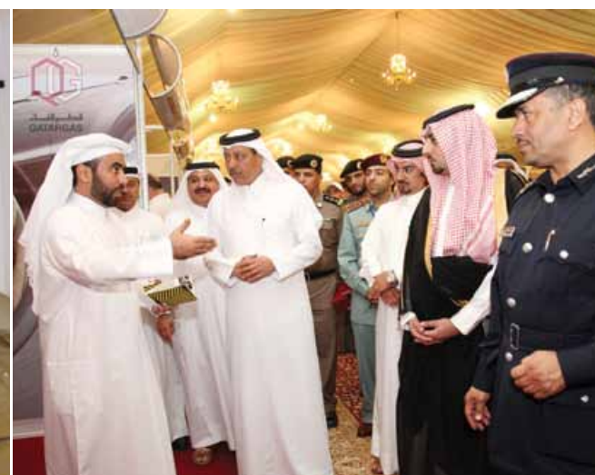
Qatargas stand at the Gulf Traffic Week