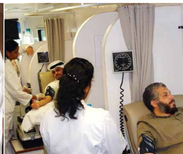
Qatargas blood donation campaign