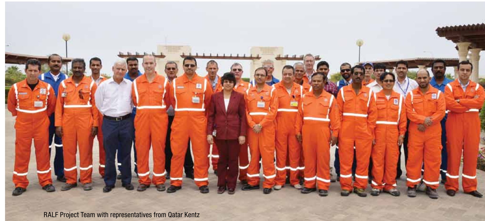
RALF Project Team with representatives from Qatar Kentz

To avoid any complacency on the part of employees, he explained, employees are continuously trained under the IIF programme. "Moreover, we believe in learning from our mistakes. Speaking up and reporting through STOP cards and other structured means of communication whereby employees can report any safety issues in their workplaces and they will get rewarded for the same. Encouraging near miss reporting is another way to avoid complacency." ■