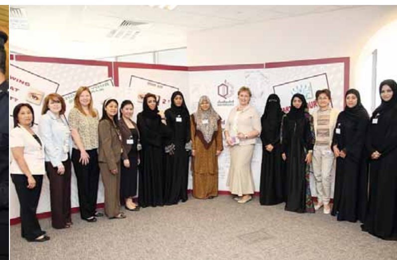
Women in the Workplace initiative