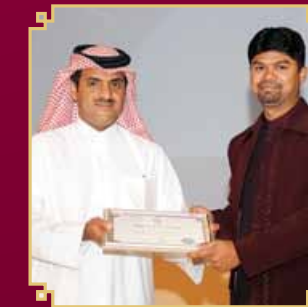
Augustin Francis Expansion & Start Up