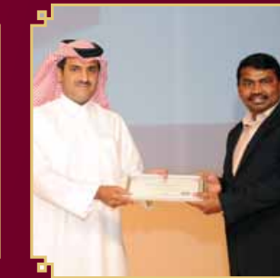
Kadarkari Urkavalan Onshore Operations