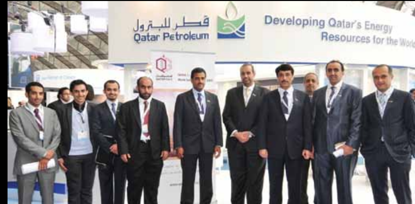
Qatargas CEO (fifth from left) with members of Qatargas' delegation at the exhibition.