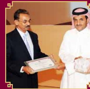
Koshy Sam Supply