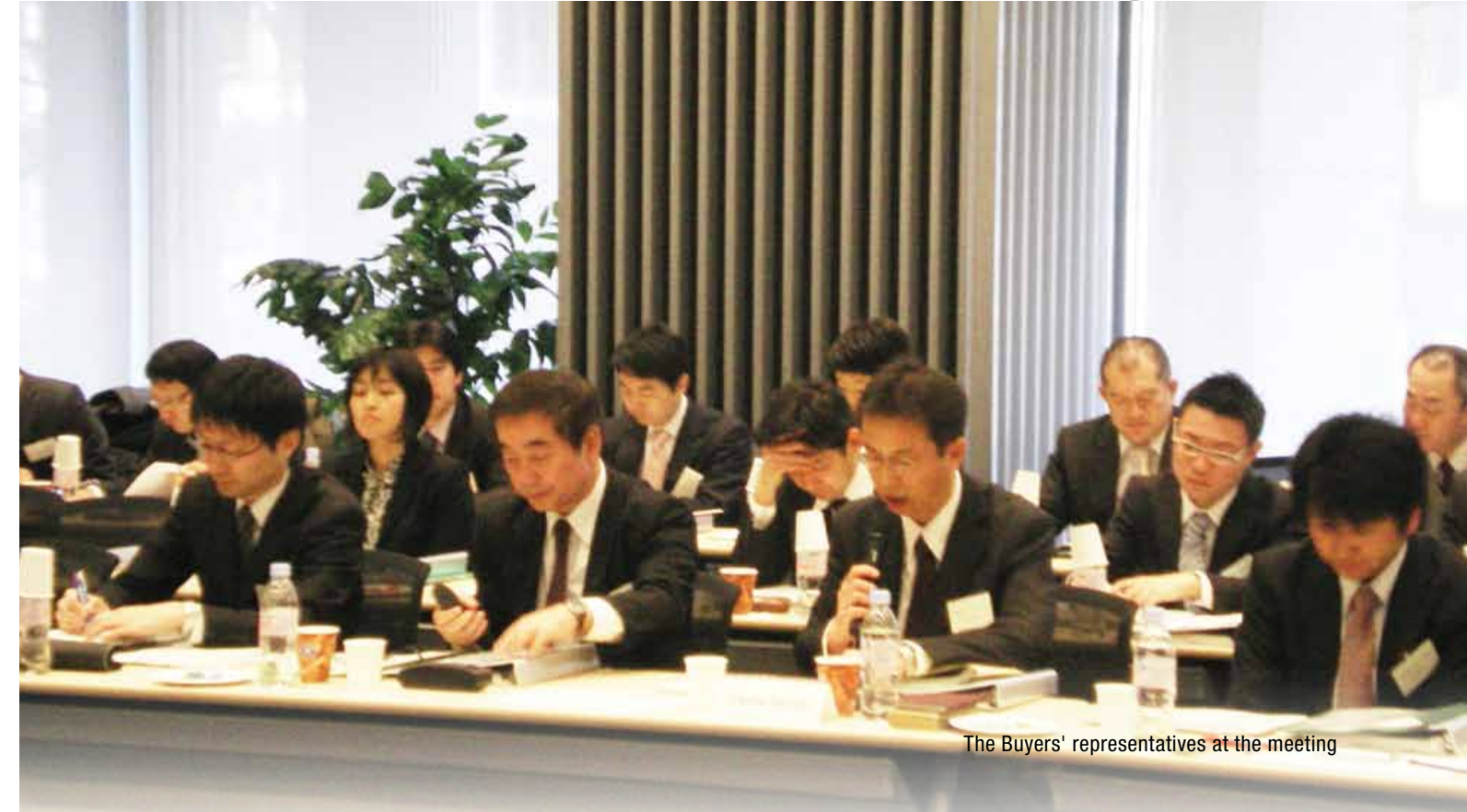
The Buyers' representatives at the meeting

Made in Qatar exhibition featured 180 companies from various sectors, under four broad categories - Manufacturing and Food Industries; Petrochemicals, General, Medium and Small Enterprises. ■